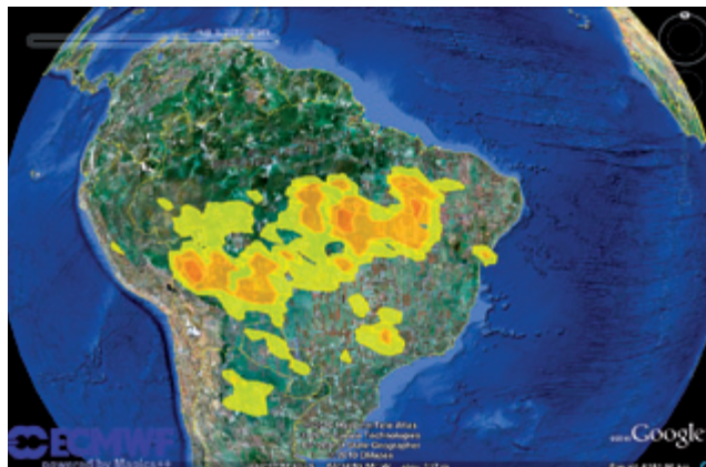
Figure 1 Snapshot of Google Earth showing the biomass burning product of the MACC (Monitoring Atmospheric Composition and Climate) project visualised through KML generated by Metview (download from http://gmes-atmosphere.eu/fire ).

OGC's Web Map Service (WMS) standard focuses on the generation and retrieval of geo-referenced map images over the web. A key concept of WMS is that of a layer representing a basic unit of geographical information that a WMS client can request as a map image from a WMS server. A client can send at least two types of requests to the server: a GetCapabilities request, to acquire information about the available layers, and a GetMap request, to generate a map image for a particular layer using a specified geographic co-ordinate reference system and graphical style. As for the visualisation, this means that the client can be relatively simple since it only has to deal with static map images, while the hard and complex task of data access and map image rendering is performed by the server.