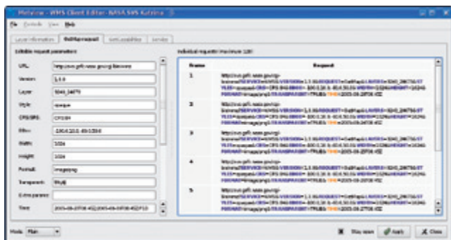
Figure 4 The WMS client's user interface in plain mode allowing the manual editing of the GetMap request.