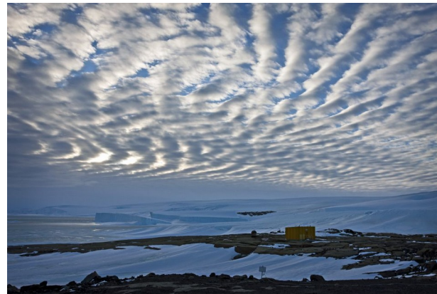
Orographic gravity waves in Antarctica